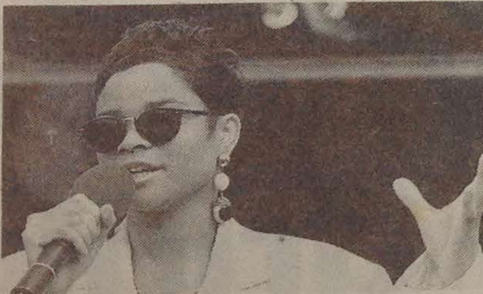
Chart-topper Gabrielle on stage